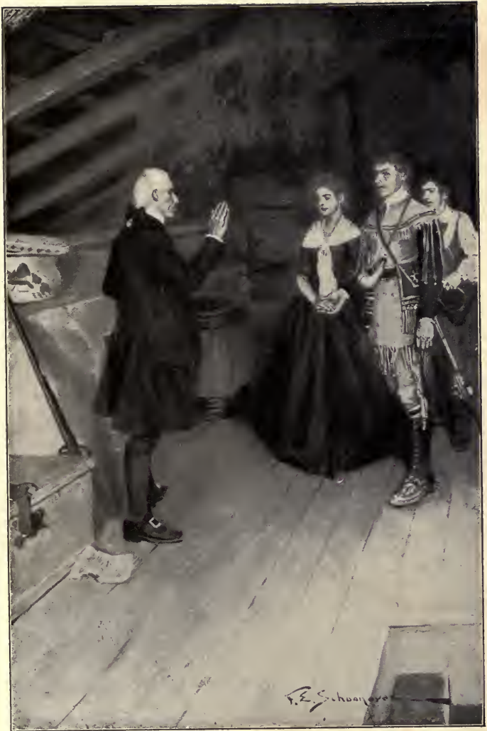
"AND SO WE WERE WEDDED"